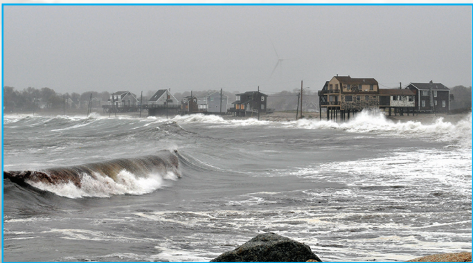
Scituate, Mass., Oct. 29, 2012 - The few summer homes left standing after the Perfect Storm in 1991, stand ready for the tidal surge that is still hours away.