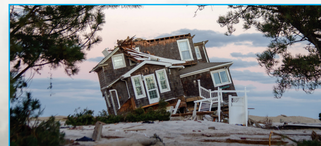
Mantoloking, N.J., Nov. 5, 2012 - This house was destroyed by the storm surge of Hurricane Sandy.