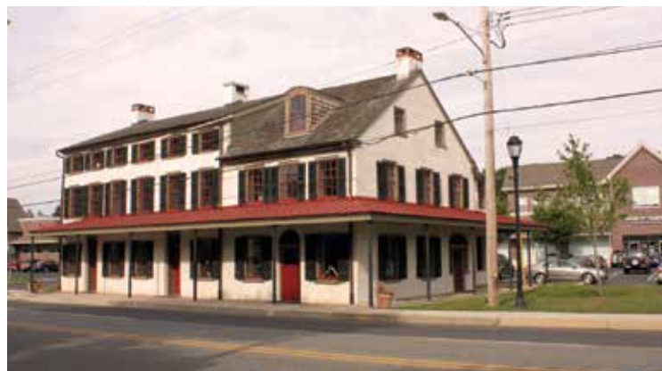
Black Horse Inn before and after renovations

Springfield, like many communities, struggle with how to best protect these vulnerable resources when most the cost of restoration is high. The township successfully acquired the Black Horse through a private land development process. Through a multi-year, multi-phase process, public, nonprofit, and private fund raising efforts helped to restore the exterior and then fit-out the interior of the historic inn. It is now home of the Springfield Historical Society and has addition space that could accommodate another tenant on the second floor.