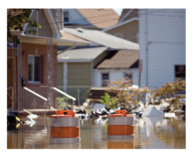
Be prepared to safely handle food and water in the event that flooding occurs.

Perishable food such as meat, poultry, seafood, milk, and eggs that are not kept adequately refrigerated or frozen may cause illness if consumed, even when they are thoroughly cooked.