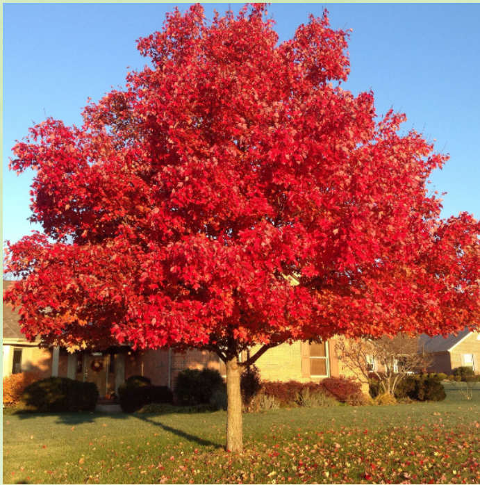
Red Maple 3 gall. ( Acer rubrum )

Brings color to your landscape year-round. Green stems turn red in winter, new leaves are red-tinged, turning to green. Fall color is deep red or yellow. Flowers are also red. Fast growing and tolerant of many soils. Grows to 40' to 60', 40' spread.