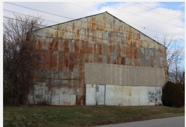
Pictured: 1725 Walnut Avenue, Oreland Former Tank Car Property